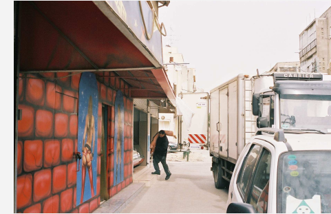
A picture from the Exhibition "Across the Road"

trafficking cycle and start a new life. In 2006, we will promote passing of legislation to establish a rehabilitation fund.